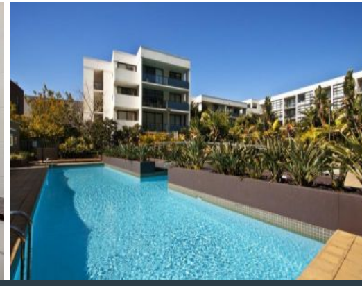
220/221 Sydney Park Road Erskineville, NSW